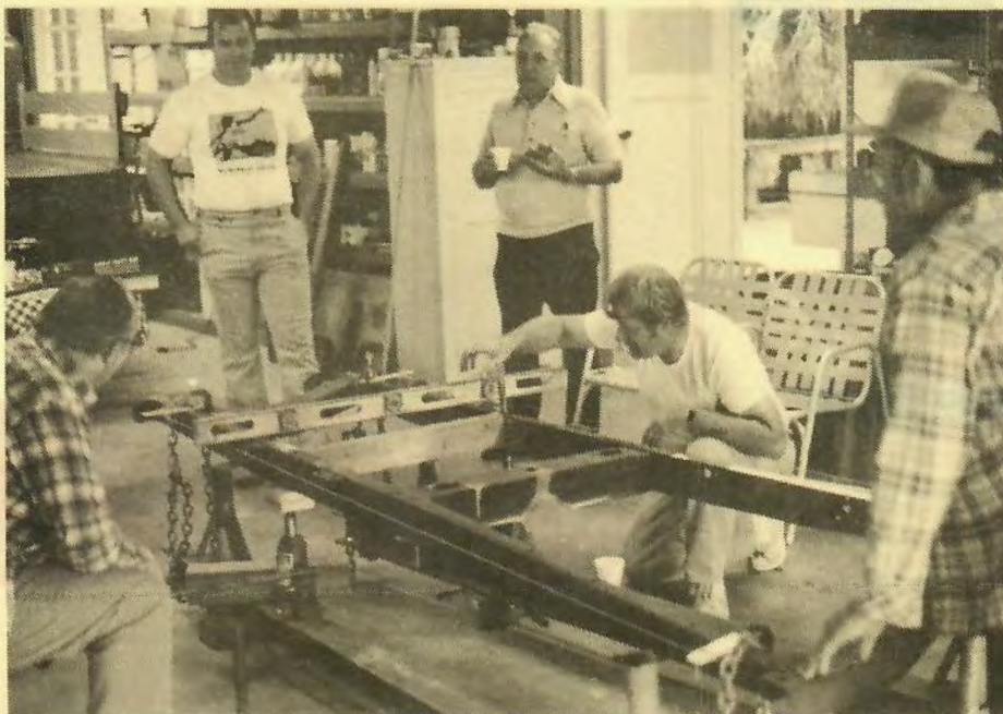
FRAME STRAIGHTENERS ANONYMOUS